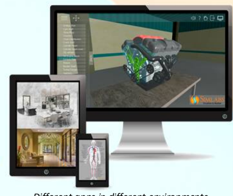
Different apps in different environments